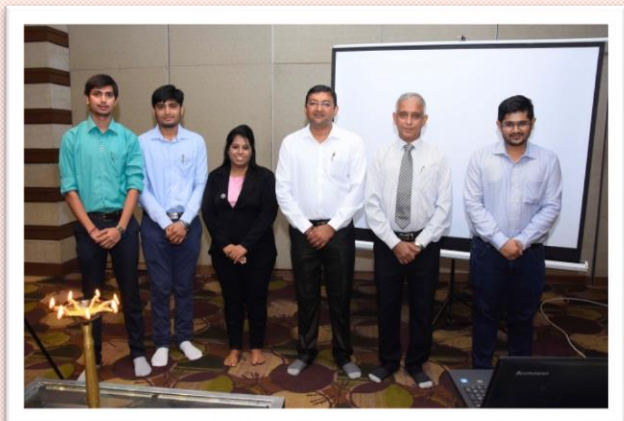
ISA PT Batch 3 rd Aug – 4 th Sept