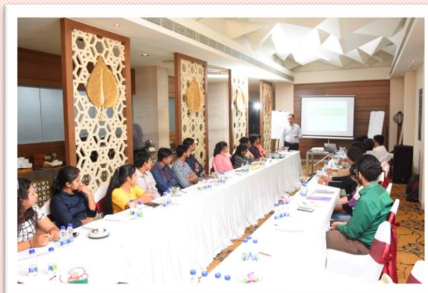
CA Students' Two Days Mega Seminar Hands on Experience to Audit 8 th & 9 th Aug'2019